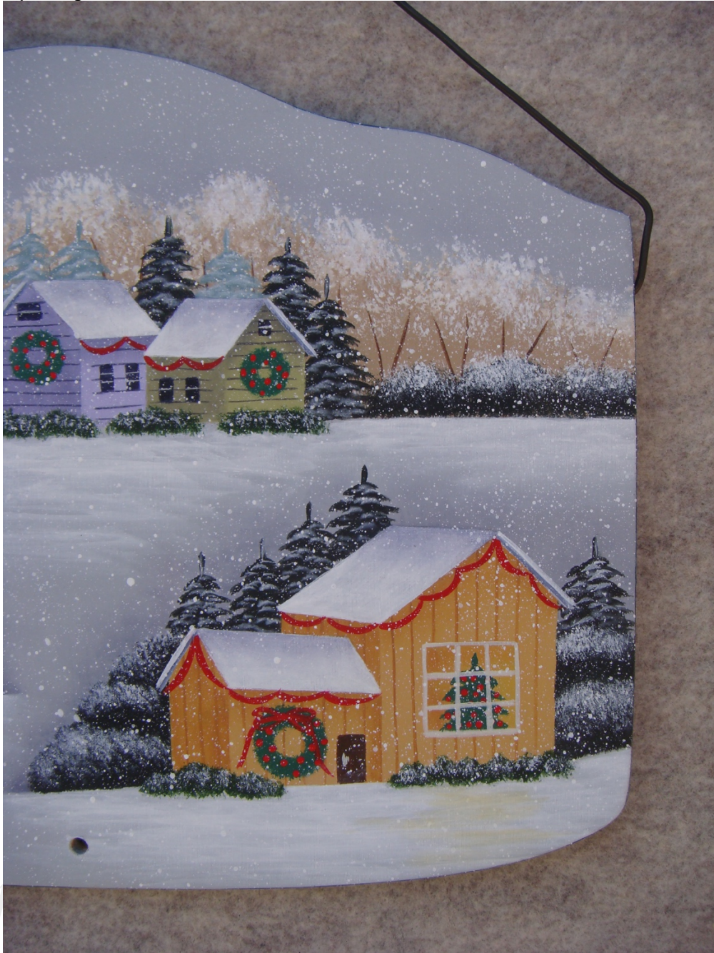
Right Side Close-up Image