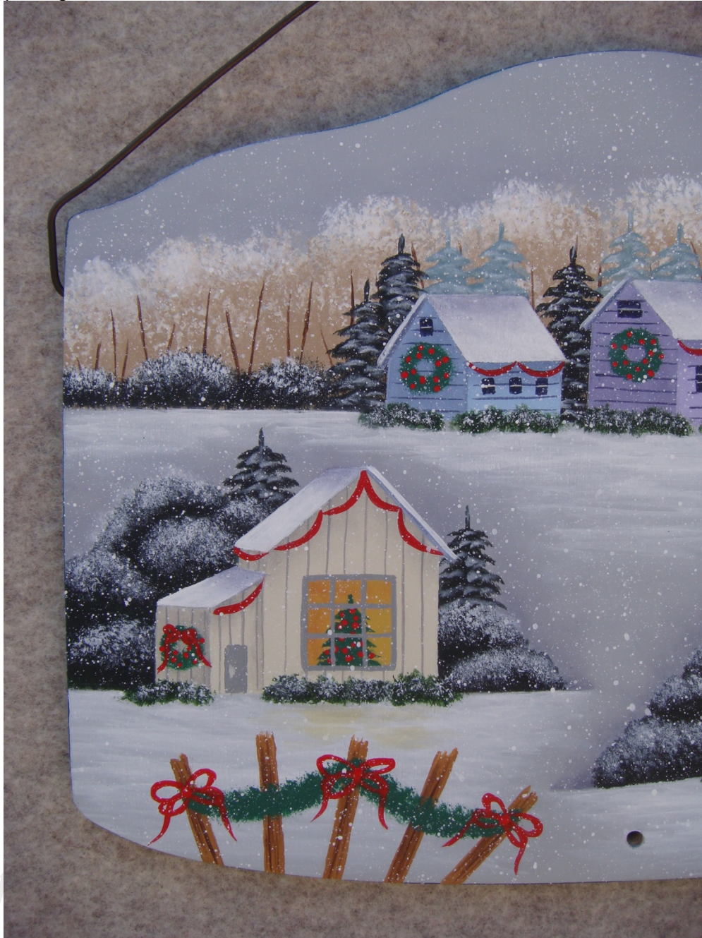
Left Side Close-up Image